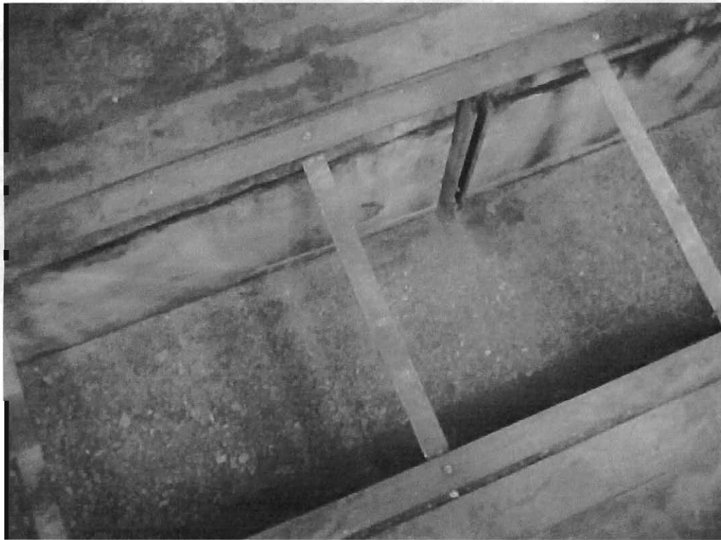
Start of trench drain that runs throughout the plant. ↑