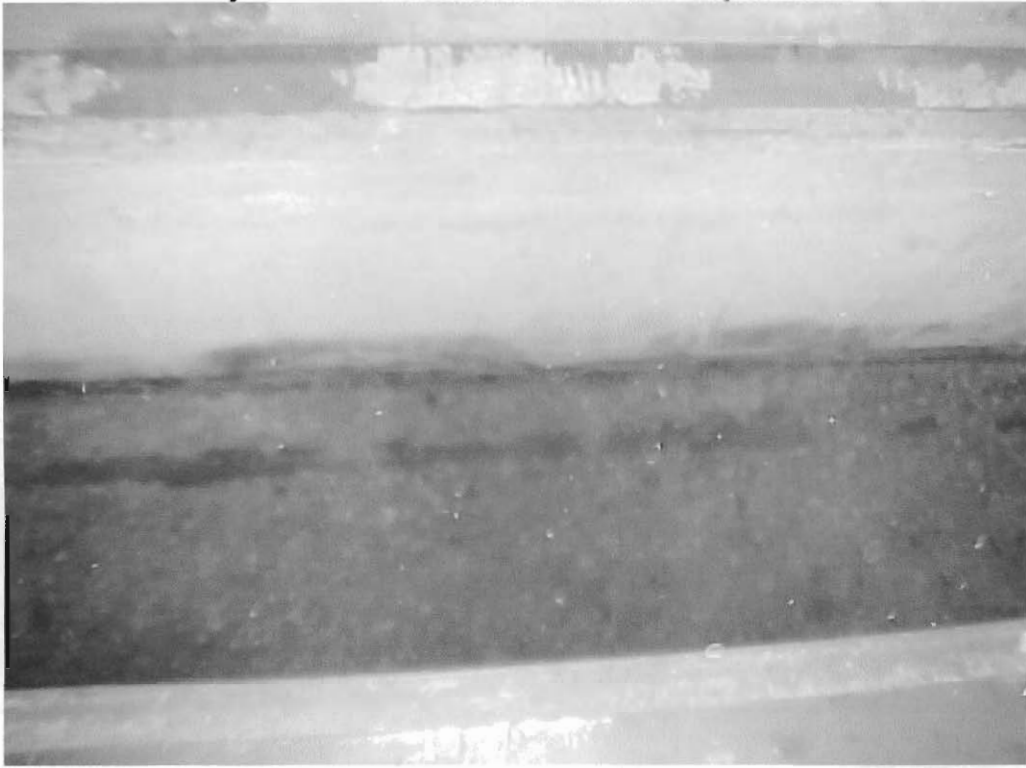
End section of trench drain that runs throughout the plant. ↑