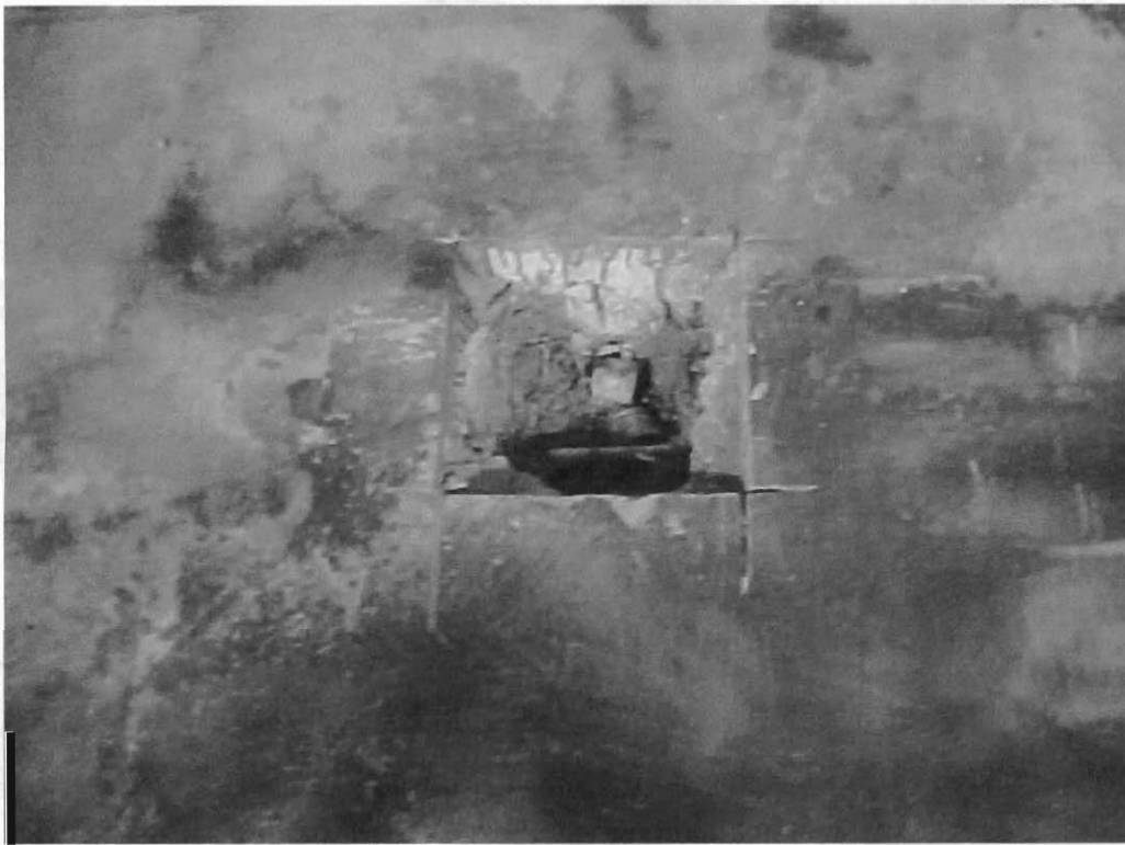
Floor section removed for soil sampling. Results were satisfactory. ↑