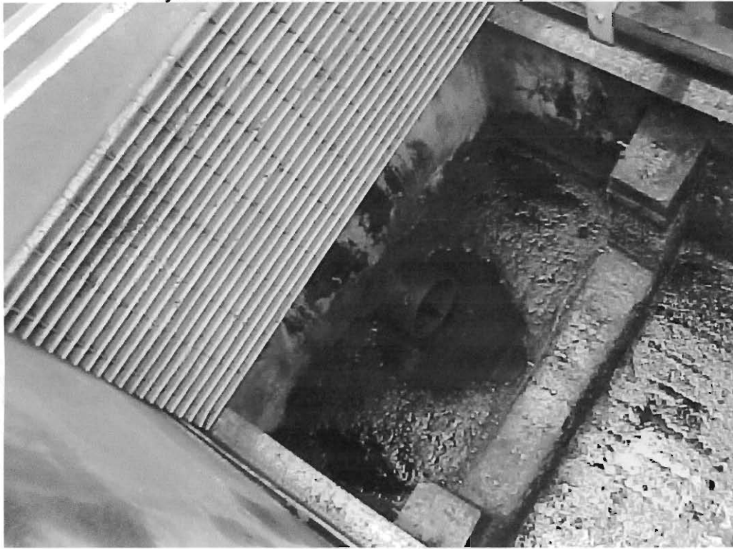
8" discharge pipe to city sewer from Fujicolor Bentonville Plant ↑